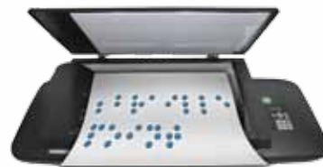
BrailleProof™ Braille inspection

*Ask us about our partner applications that can be included in NetCloud™