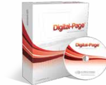
Digital-Page™ Artwork/Image inspection