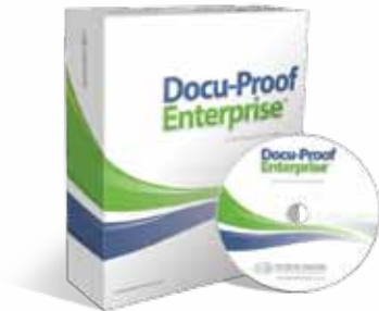
Docu-Proof™ Text inspection & Spell Check