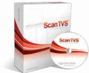
Scan-TVS™ Press sheet & printed Component inspection